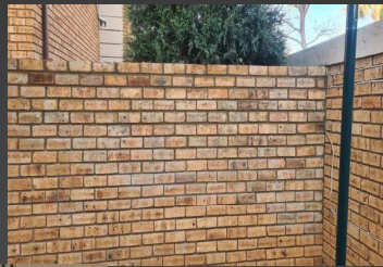
BOUNDARY GARDEN WALL

LOCATION: Boksburg Gauteng CUSTOMER: Curt Lesson CELL: 082 450 0821