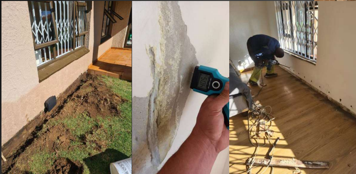
Damp and Waterproofing

LOCATION: Roodepoort Customer: Warren Emfuleni complex Cell: 082 844 4666