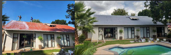
Tile Roof Water Proof and Rubber Paint

LOCATION: Boksburg Gauteng CUSTOMER: Verushka CELL: 084 392 2937