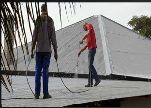
METAL ROOF WATER PROOF

LOCATION: Boksburg Gauteng CUSTOMER: Curt Lesson CELL: 082 450 0821